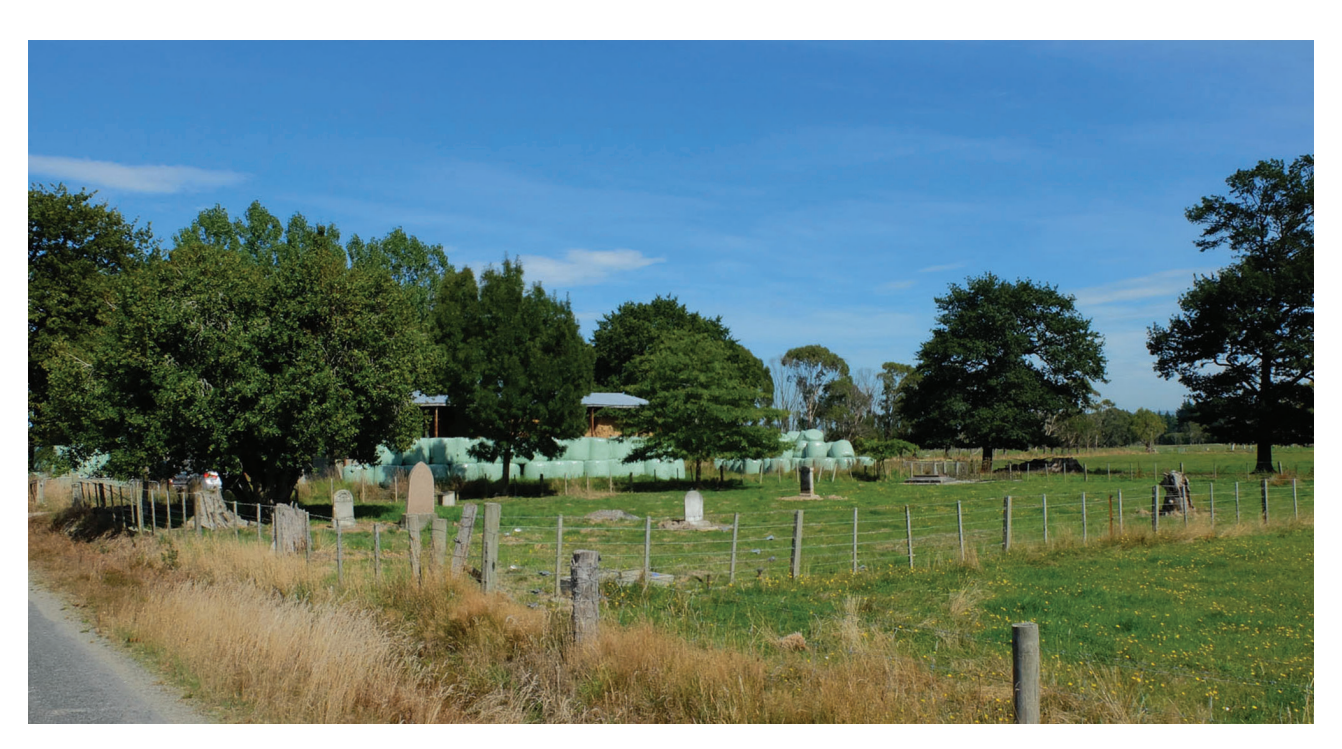
Fig. 1.4. The St. Johns Cemetery seen from Back Road in 2016.

actual cemetery boundary and finding 'lost' graves using archaeological methods. The outcome was a collaboration between the descendant community group and academic researchers that provided an opportunity to investigate an early farming community from archaeological, bioarchaeological and social history perspectives.