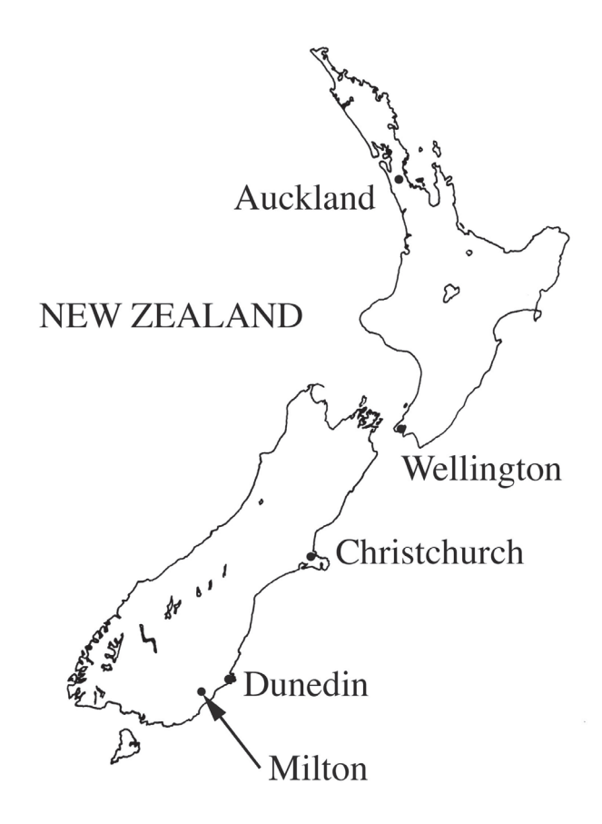
Fig. 1.2. The location of Milton in South Otago

The intentions of the TP60 group were to repair the remaining headstones (which was completed with the help of the Historic Cemeteries Conservation Trust), to identify the extent of graves within the cemetery and ultimately create a well-maintained lawn cemetery. They also carried out extensive research into the history of the cemetery and those known to be buried there, which was collated into a single volume (Findlay et al 2015). The task of identifying the locations of unmarked graves, and in particular those suspected to be outside the cemetery fence, proved to be problematic as remote sensing options were too expensive for an unfunded community group,