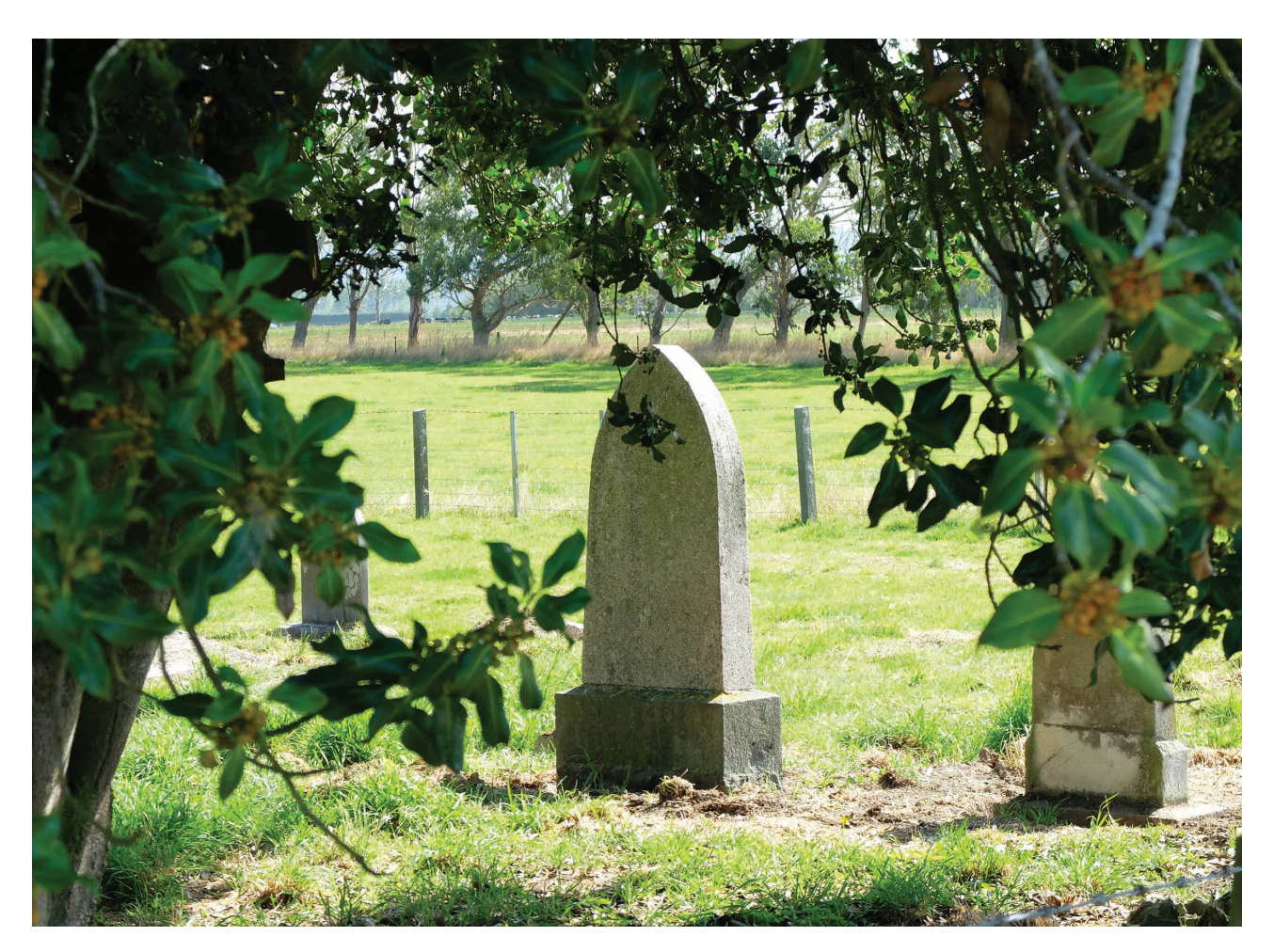
Fig. 1.5. Some of the gravestones in the St. John's Cemetery in 2016. No marked graves were investigated during the archaeological excavations.

After extensive public consultation, an archaeological authority (No. 2017/171) from Heritage New Zealand and a disinterment licence (No. 17-2016/17) from the Ministry of Health were obtained, and the Anglican Church (still the landowner) gave its permission for the disinterments. The archaeological excavation of part of the cemetery took place between 28 November and 16 December 2016. The excavation was preceded by a brief blessing by Bishop Kelvin Wright and whakawātea by Rachel Wesley (Te Rūnanga o Ōtākou Ngāi Tahu) on 27 November, and closed by a blessing by the local Vicar, Rev. Vivienne Galletly, on 16 December. Each time a new burial was found (generally at the point where the top of the coffin was identified) Rev. Galletly gave a brief service at the graveside. In cases where individuals were not exhumed (generally due to very poor bone preservation) Rev. Galletly gave a burial service prior to the grave being backfilled. The traditional Anglican burial service, as these people would have known it was used (all burials that we could date were from the 1870s).