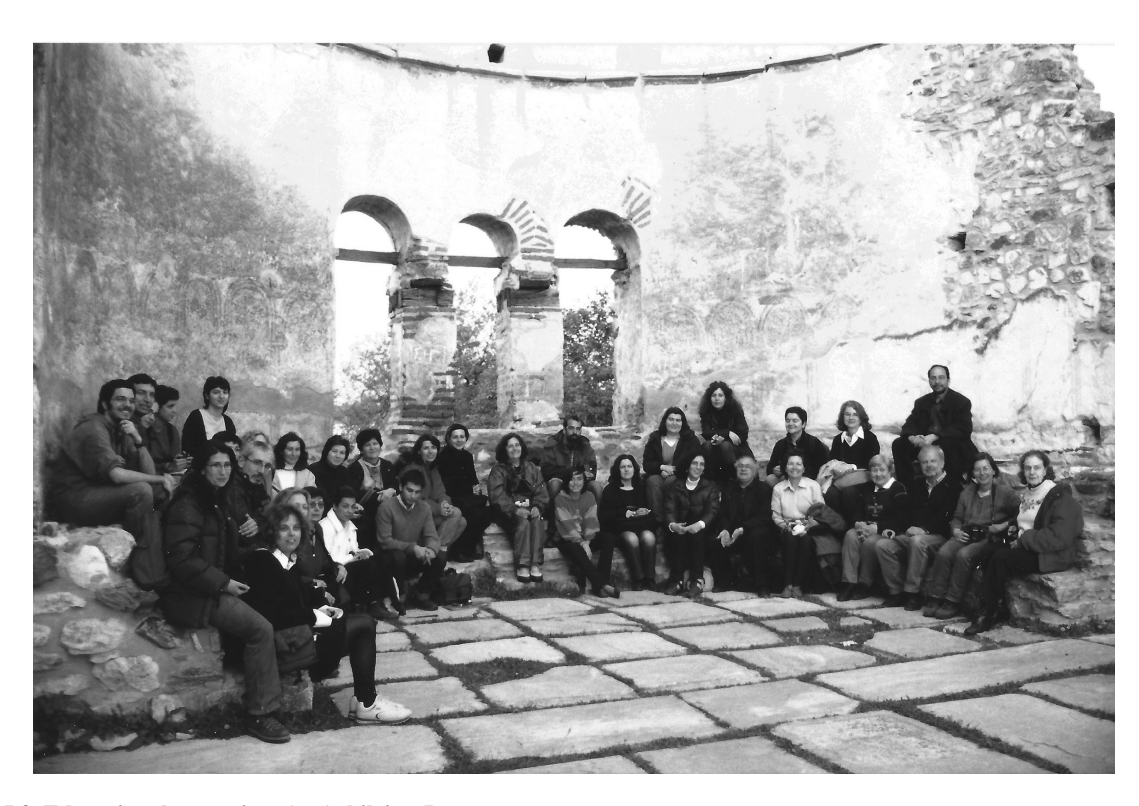
Figure I.3. Educational excursion, Ag. Achileios, Prespes.

who had had at least one of them as their supervisors, although mostly it turned out they had studied with both.