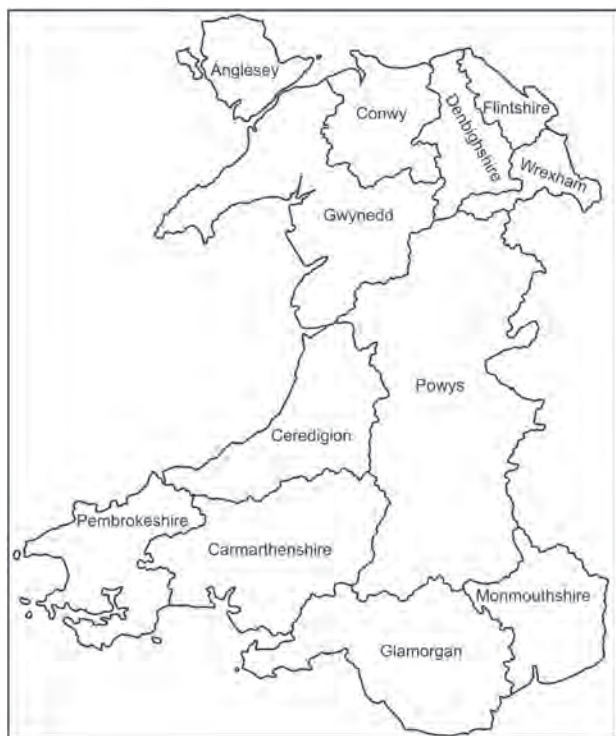
Figure 1: Map of Wales with the administrative regions used in this study.

Wales covers an area of more than 20,000 square km of land bounded to the north and west by the Irish Sea, to the south by the Bristol Channel, and east by a land border with England running between the Dee estuary in the north and Severn estuary in the south. More than 3700 prehistoric monuments from the Middle Neolithic to Middle Bronze Age (MN-MBA) periods, between 3600–1200 BC, have been identified in Wales. Despite more than 400 years of archaeological research in this region, no work has so far been undertaken to provide a synthesis of the evidence for funerary and ritual practices into a single corpus. This research aims to readdress this situation by providing a detailed summary of the types and chronology of funerary and ritual sites as well as a re-assessment of the contextual evidence for funerary rites and ritual practices within a contemporary archaeological framework. This study also aims to refute the oft-quoted idea that the analysis of skeletal material from prehistoric burials is of limited value due to the high levels of bone destruction from acid soils. The collation and analysis of contextual and osteological data undertaken as part of this research has in fact revealed several insightful patterns on the character of Neolithic and Bronze Age practices.