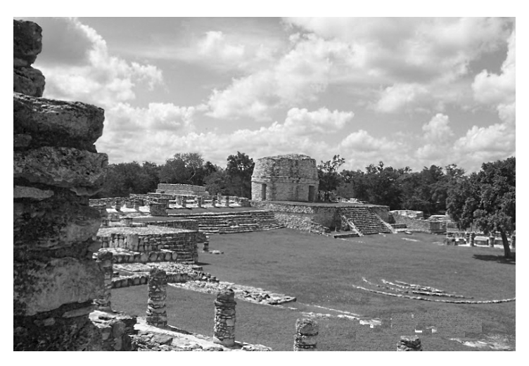
Figure 1-3. The observatory of Mayapán

Mayapán was the last Maya capital in the lowlands. Until the conquest, no other centre rose to become the new Mayan political centre. The Europeans arrived a few decades after Mayapán was abandoned, marking the start of the conquest and colonisation period.