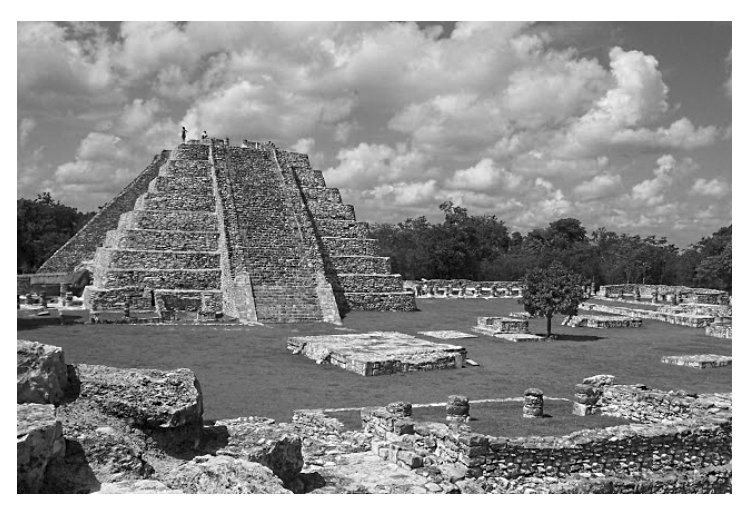
Figure 1-2. Mayapán