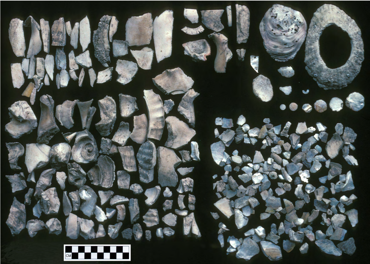
Figure 1.2. Shell from one small collection area (CAE) on the east side of Ejutla de Crespo.